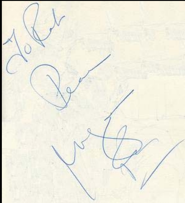
Signature in fine-tip pen (1982)