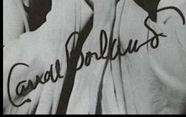
Signature in marker (c. 1992)