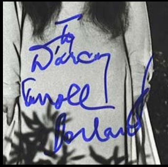
Signature in marker (c. 1993)