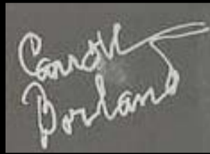
Signature in paint pen (c. 1994)